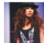
China: Going On